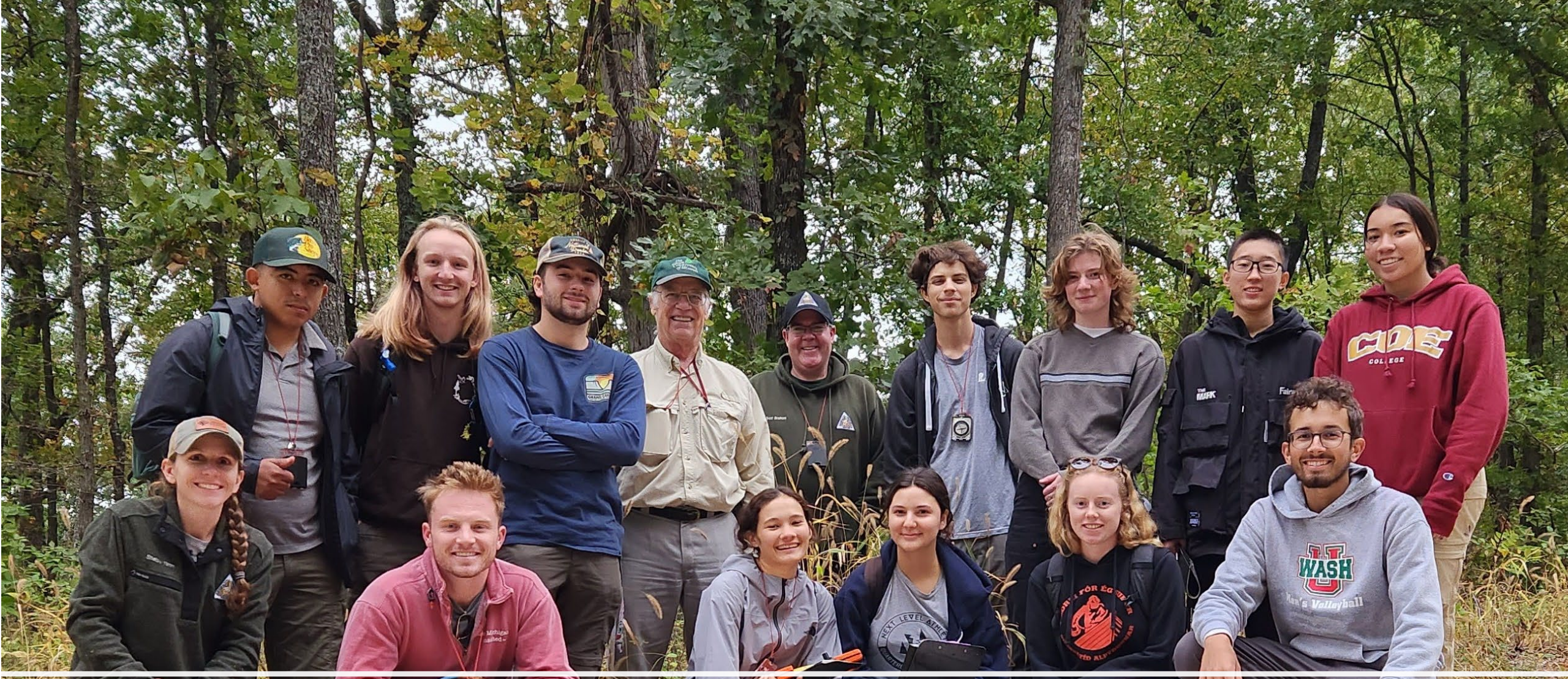
Washington University October 14 th , 2023