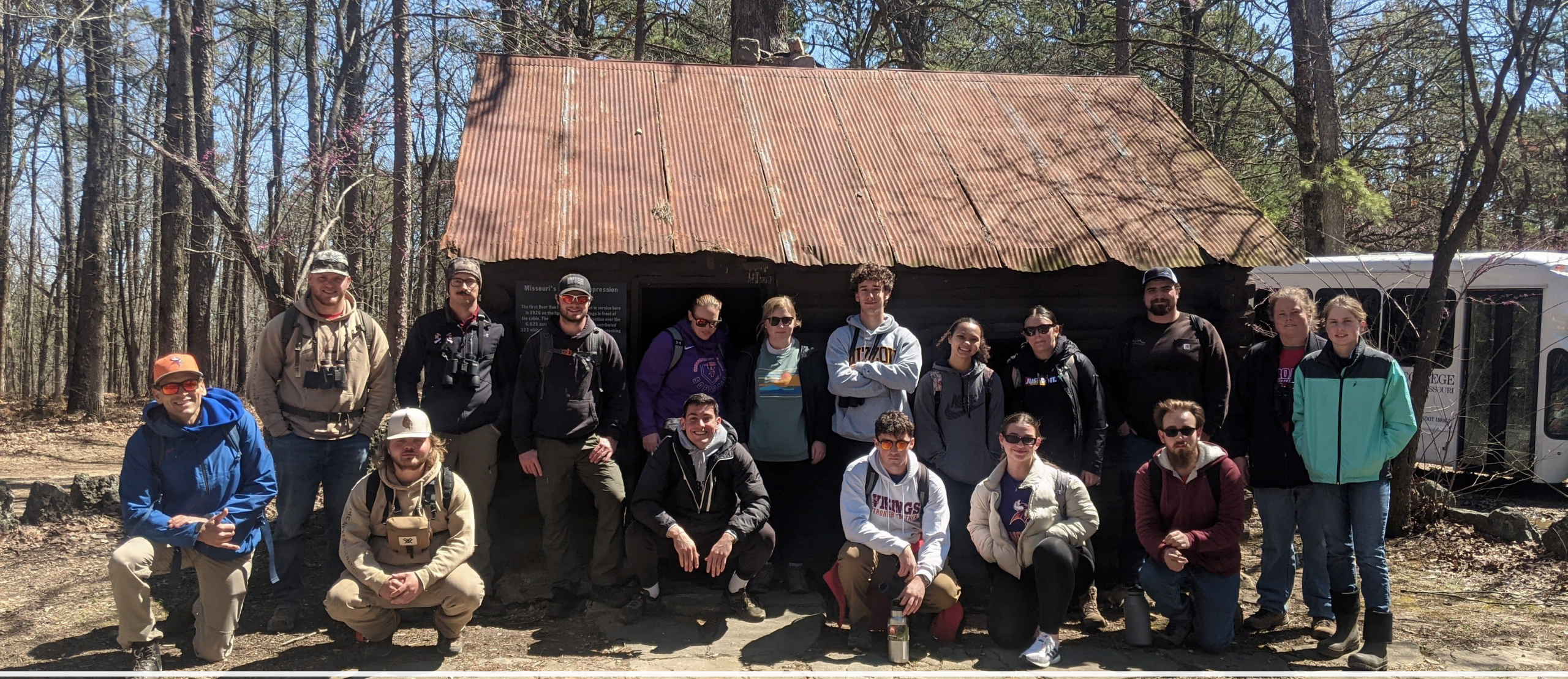
Missouri Valley College April 1, 2023