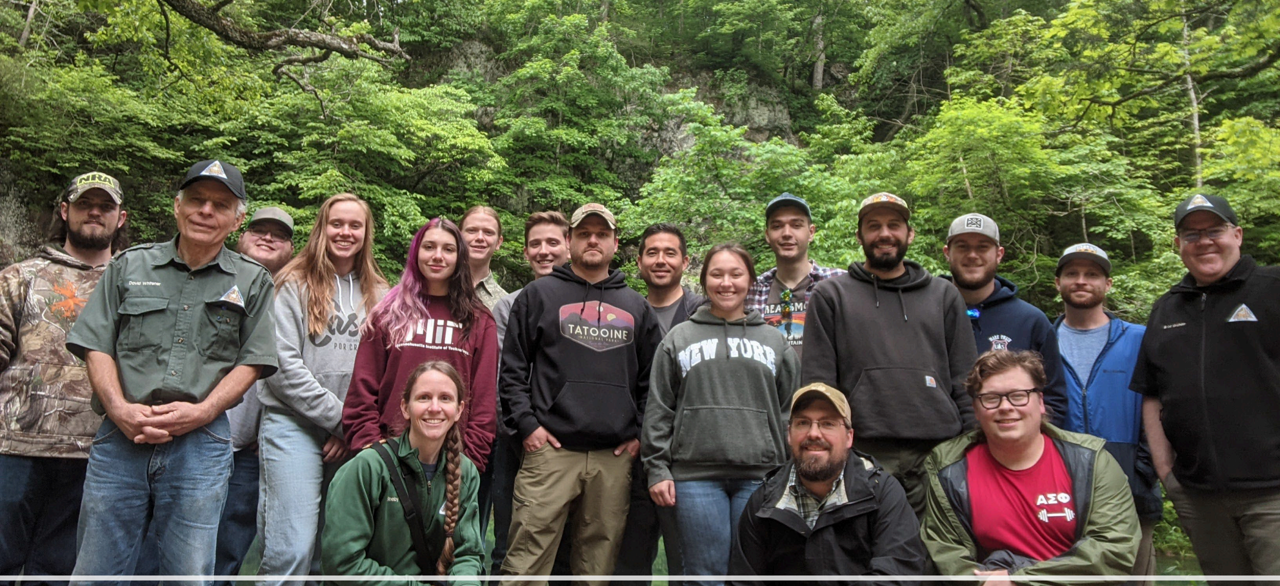
University of Missouri May 24, 2022