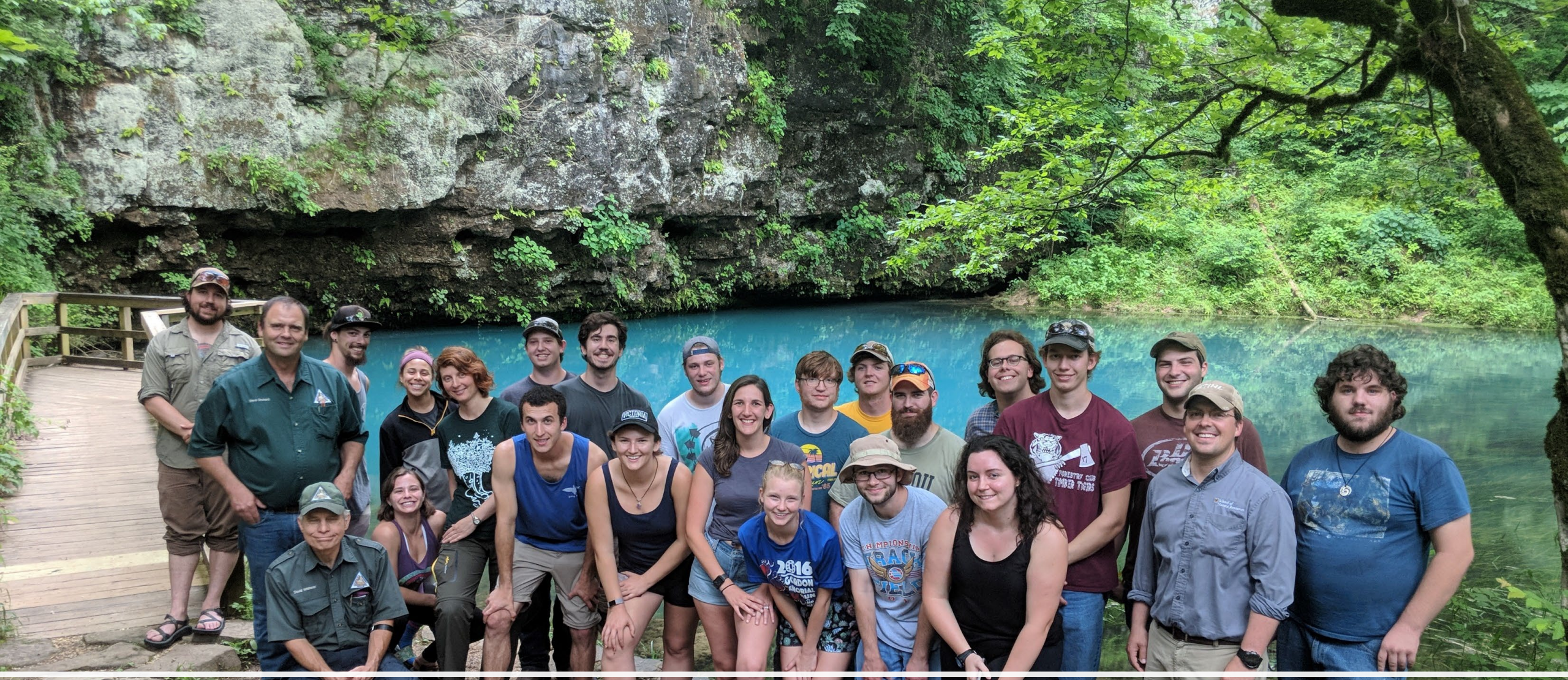
University of Missouri June 4, 2019