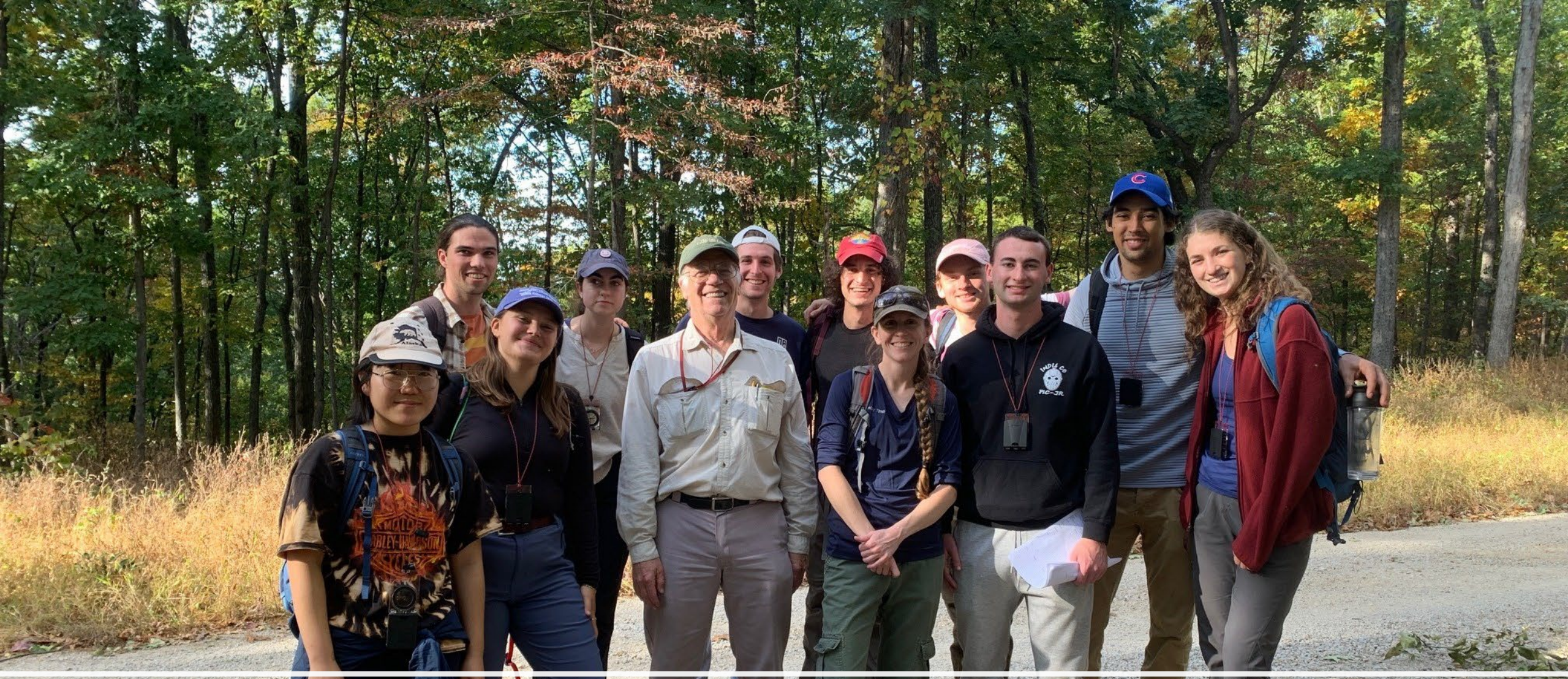
Washington University October 15, 2022