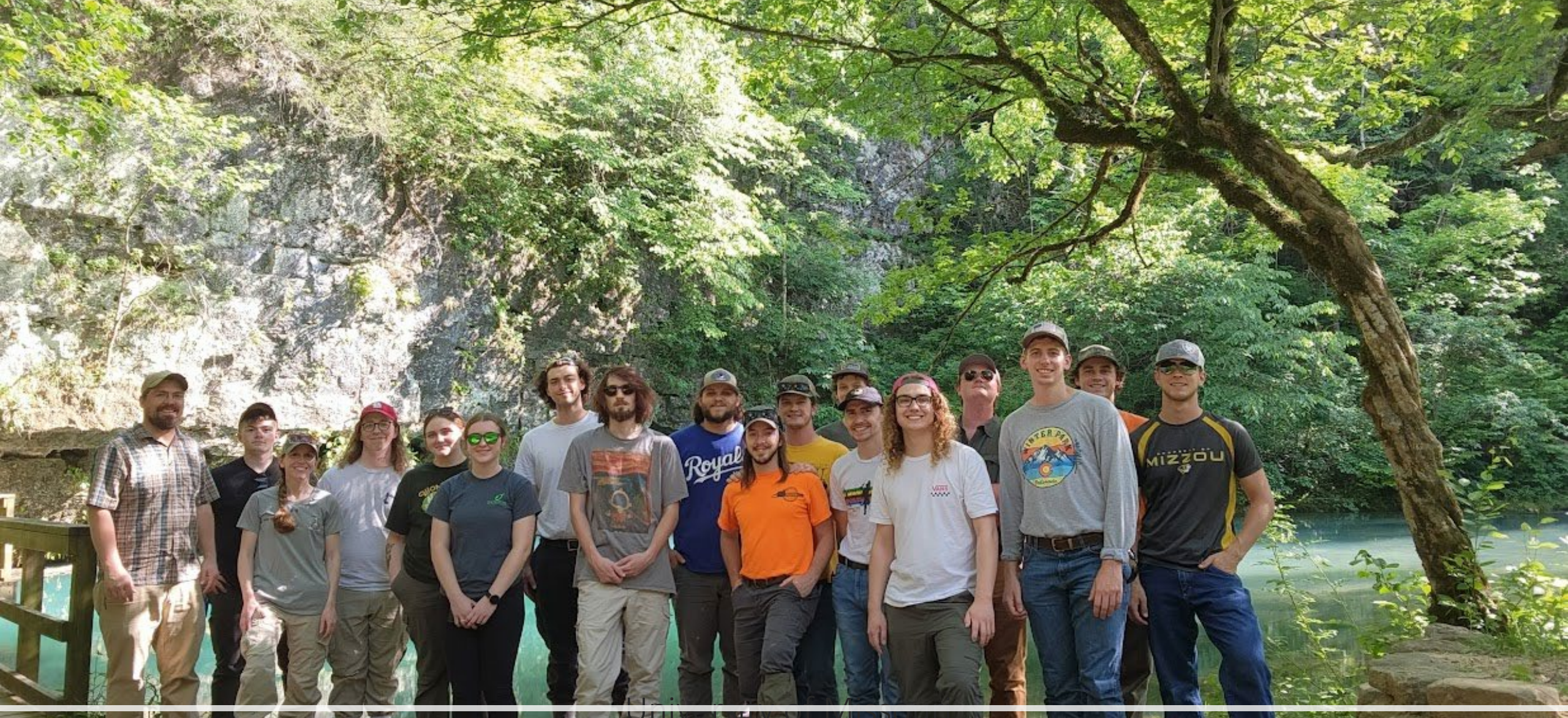
University of Missouri May 30, 2023