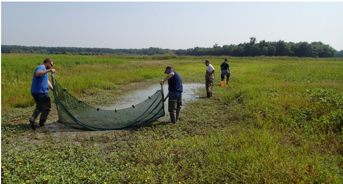
A seine is an active gear suited for deeper locations.

Monitoring cryptic species, like fish and amphibians, helps reduce uncertainty and informs management decisions of a broader range of wetland dependent taxa. However, the time and effort required for monitoring are limited, so knowing the trade-offs of different survey methods, site selection, and timing can help managers determine best surveying practices based on monitoring objectives. The following guidelines are based on extensive sampling of 29 wetlands across three ecoregions in Missouri during 2015-2016. Sampling compared two active methods (dipnets and seines) and two passive methods (minnow traps and mini-fyke nets). See Kamps (2017) for detailed methods, results, and discussion.