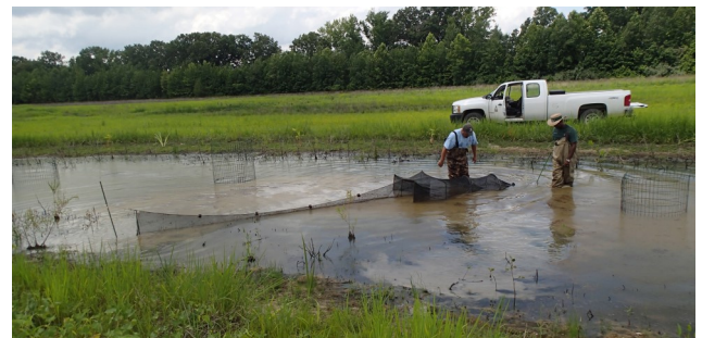
A mini-fyke net is a passive gear checked after leaving it overnight.

Species Identification: Using field guides and documenting species with photographs is a good first step. Monitoring provides an opportunity for biologists to collaborate outside their expertise.