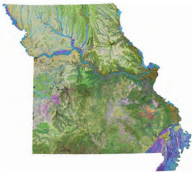
Figure 2. The Ecological Sites of Missouri.

management at a variety of scales, from eco-region to landscape, and from field to farm. For instance, the